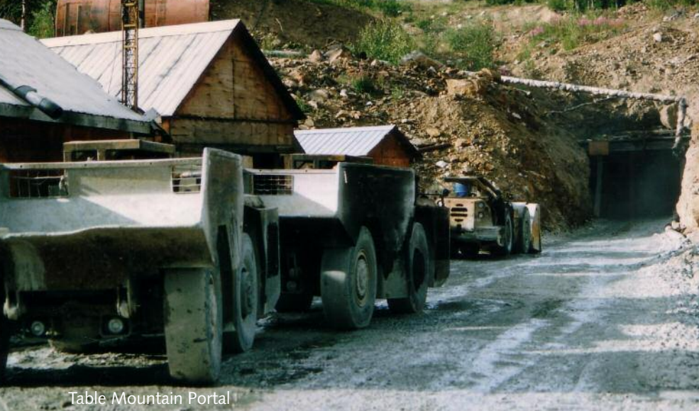
Table Mountain Portal